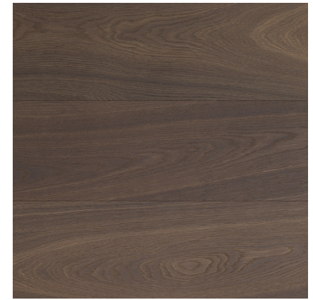
Pale Smoked Oak, brushed