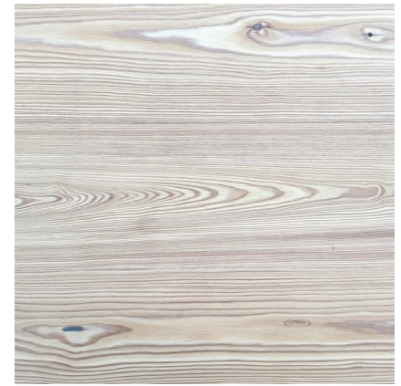
Larch Bianco, brushed