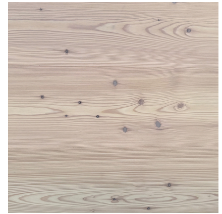
Larch Alaska, brushed